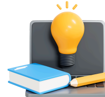
Study Resources & Templates