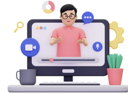
French Grammar & Vocab Revision