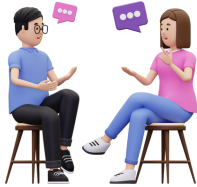
Live Speaking Practices & Feedback

Boost your confidence and fluency in French speaking with Live speaking practices. Also benefit from expertly curated study resources, TEF/ TCF Speaking test demos, and exclusive video lessons.