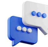
Continuous Query Resolution Support