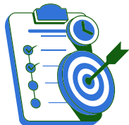
French Level Tracker and Exams