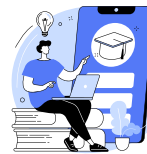
Self-Driven Video Lessons