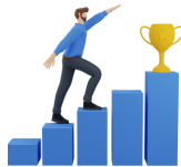
Progress-Based Learning Mechanism

With a powerful blend of self-paced lessons, live weekly group sessions, and expert-curated resources, this program has EVERYTHING you need to master French efficiently and confidently ace your TEF/TCF Canada Exams.