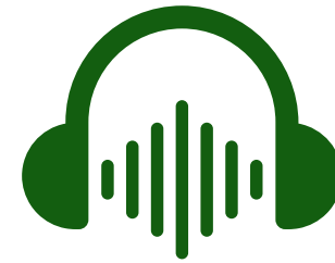
Summarization for Active Listening