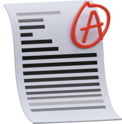
Listening Comprehension MCQ Quizzes

With comprehension quizzes, subjective questions and summary exercises, you'll train your ears to recognize French effortlessly—so you can listen with confidence and respond with ease.