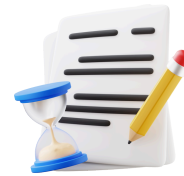
TEF Canada Exam Simulations