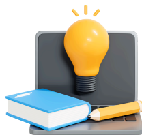
TEF Canada Exam Prep Resources