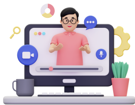
French Grammar Revision

Access French Grammar Revision materials to establish a solid foundation, engage in practice with TEF Canada Exam Simulations, and utilize organized Exam Prep Resources for efficient learning. Additionally, take advantage of personalized One-on-One Feedback Sessions to enhance your confidence.