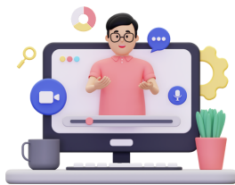
French Grammar Revision

Access French Grammar Revision materials to establish a solid foundation, engage in practice with TEF Canada Exam Simulations, and utilize organized Exam Prep Resources for efficient learning. Additionally, take advantage of personalized One-on-One Feedback Sessions to enhance your confidence.