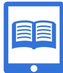
Exclusive Grammar & Vocabulary e-Books