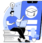
Self-Driven Video Lessons