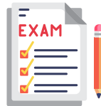
Custom Study Resources and Final Exam