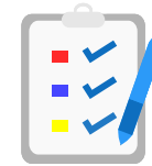
Assignments, Quizzes and Practices