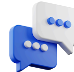
Continuous Query Resolution Support